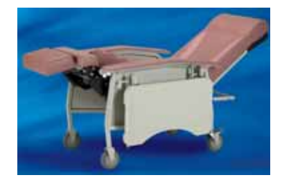
Full recline position.